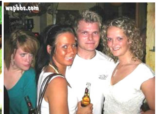
Winners & grinners, saints & sinners – NCC has them all in 2010, so happy shopping!